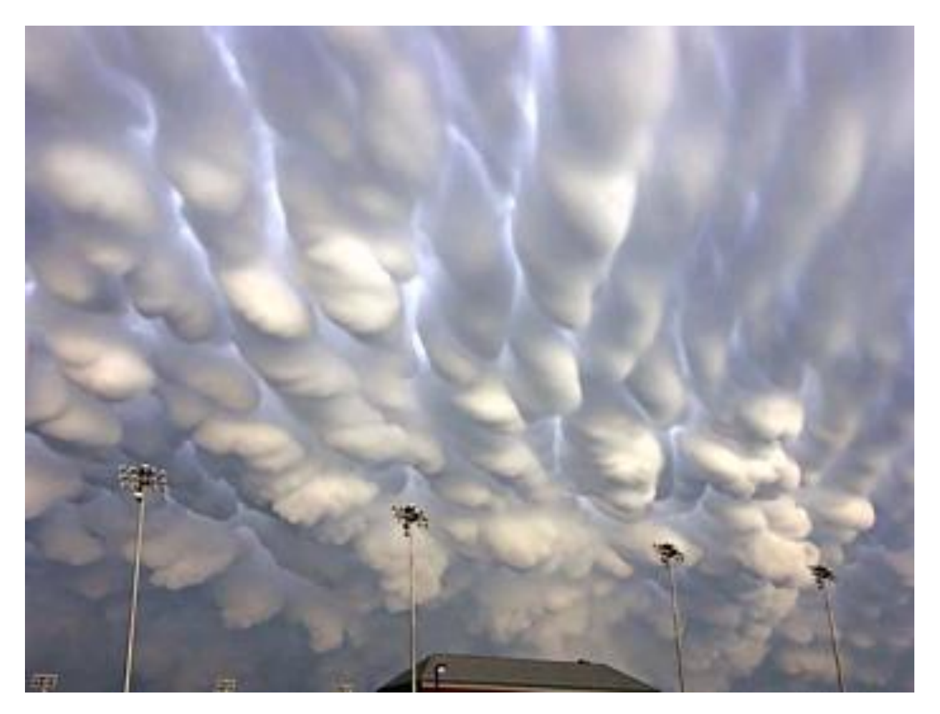
Figure 2 : Example of mamatus

Figure Sketch of the cloud layer and the profiles of potential \theta , liquid water l and water vapour mixing ratio r. The liquid water is 0 outside the cloud.